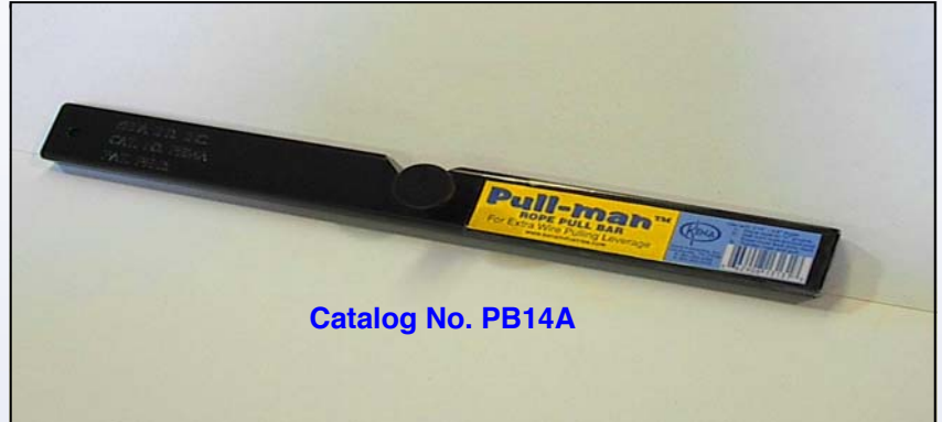
Catalog No. PB14A

The Pull-Man rope pull bar is made for manually pulling your pull rope while pulling wire through conduit. This simple device will work on any rope with a diameter of 3/16" through 5/8". The knurled knob grips the looped rope as it exits the "V" groove. The rope then slips under itself and locks as tension is applied for pulling wire. The Pull-Man provides extra pulling leverage when you need it most.